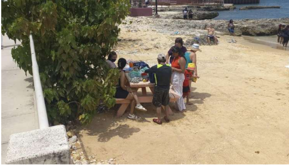
Image: Cruise ship day August 2022. Tourists using the picnic bench