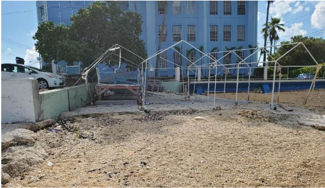
Image: During the COVID pandemic the Fish Market was relocated to the GT port ferry terminal. The Red Spot Beach was vacant from them for at least a year. Significant concrete has been poured on the beach (as seen here) over the years without planning or landowner permission.

2020/2021 Covid - the Fishermen left the site altogether and sold from a different location