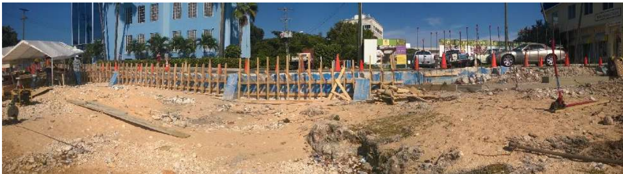
Image: Sidewalk under construction August 2014. Landowner paid all expenses to construct an extra wide sidewalk, providing a safe space for pedestrians.