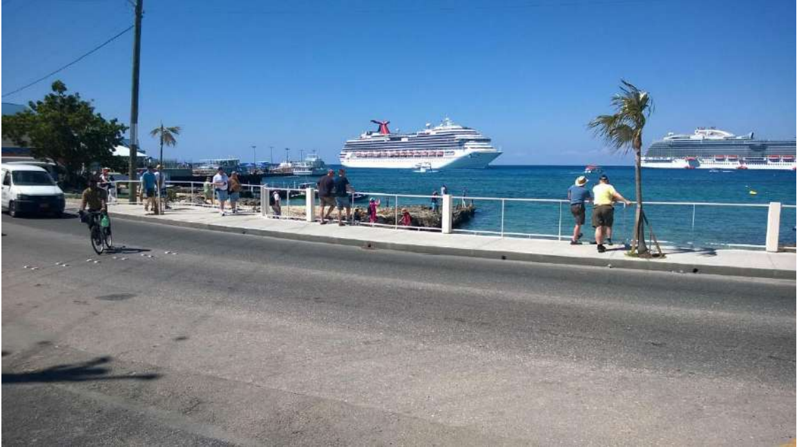
Image: Sidewalk completed early 2015. This photo in Feb 2015 shows the planters before they were infilled with cement by the fisherman