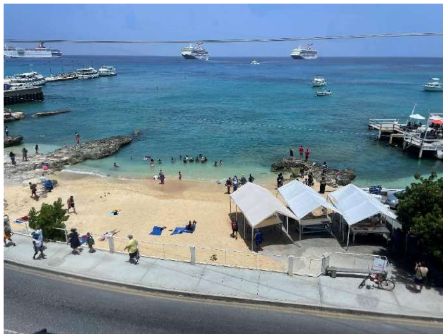
Image: Cruise ship day in GT. Tourists using the beach July 14, 2022 with fish being sold