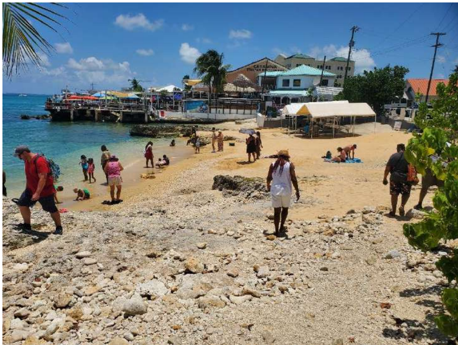
Image: Cruise ship day in GT. Tourists using the beach July 5, 2022 with fish being sold