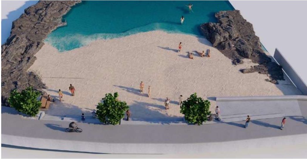
Image: The intent of the planning application is to make a true beach park for everyone to enjoy. A qualified Architect was hired to develop a concept and full plans have been put forward to the planning board. Client has attended 2x CPA meetings during 2023 and 2024. Beach will be refurbished and a ramp and large staircase will provide easy pedestrian access. The land will be put into a trust, then given to the government, the people of the Cayman Islands.