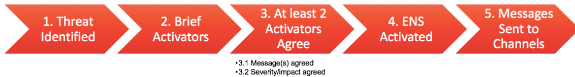
Figure 2: Activation protocol

Each hazard management plan identifies the responsible persons that will declare the type of messages to be broadcast. Figure 2 shows the process for activating messages with the proposed ENS.