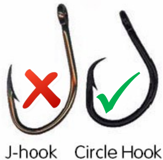
J-hook Circle Hook

Use 'circle hooks', instead of traditional J-hooks, when possible. Circle hooks are designed to hook the fish's mouth, rather than the stomach, making removal easier and less harmful.