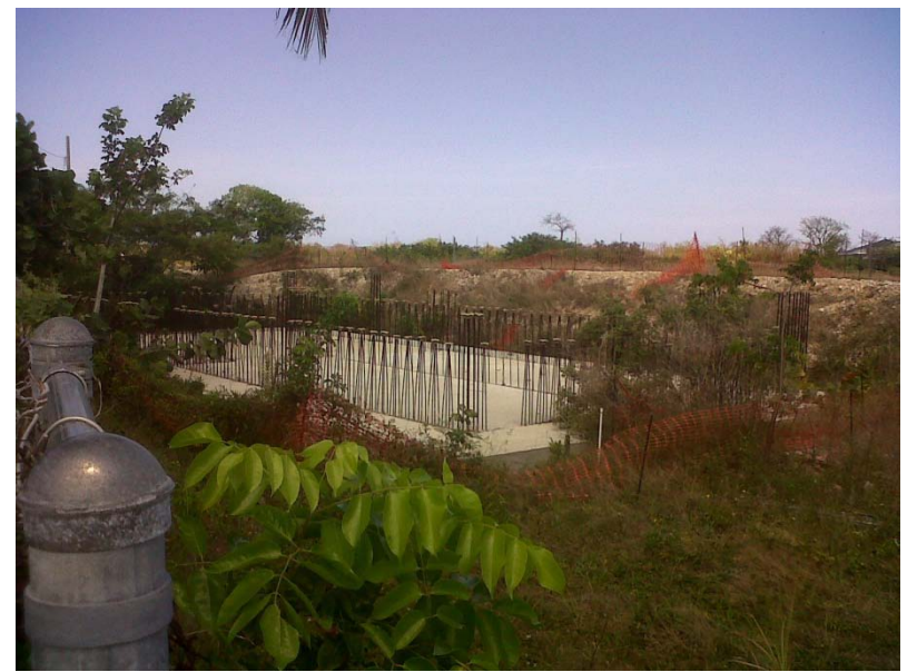
Exhibit 12: Beulah Smith High School building site, March 2012