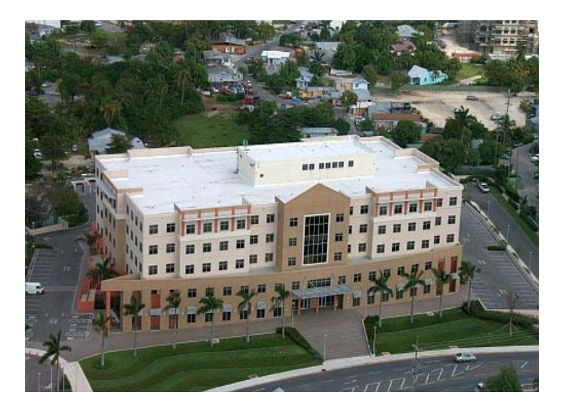
Exhibit 6: Government Administration Building