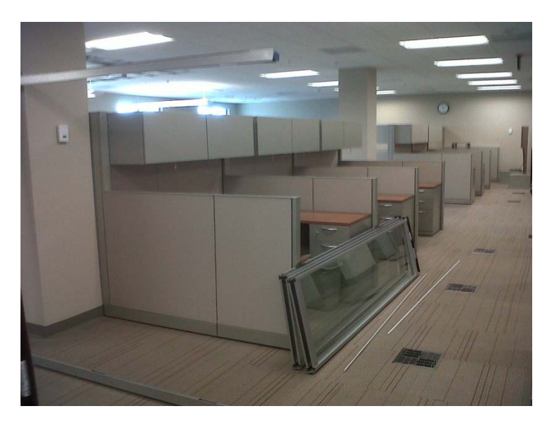
Exhibit 7: Government Administration Building, 3<sup>rd</sup> floor, March 2012

Exhibit 6: Government Administration Building