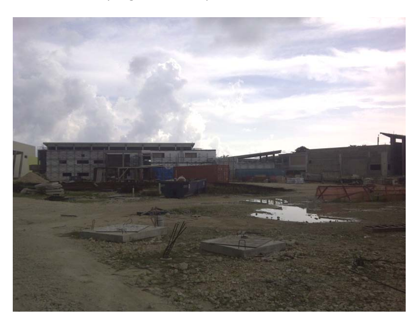
Exhibit 9: John Gray High School, September 2011

Recommendation #2: Government agencies should produce business cases, for all proposed major capital projects, that clearly outline management's considerations concerning the business objectives to be achieved, the various options for delivery and the full life time cost associated with each option. A business case should be an important part of Cabinet's consideration of whether to approve a proposed major capital project based on affordability and alignment with policy objectives.