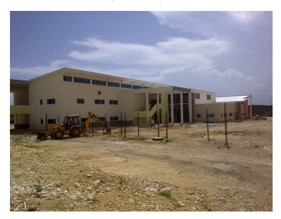
Exhibit 13: Clifton Hunter High School, September 2011

Recommendation #6: Government agencies should not allow work to commence on major capital projects without a suitable and approved contract or some other appropriate legal instrument to be in place so that the interests of the Cayman Islands Government are protected.